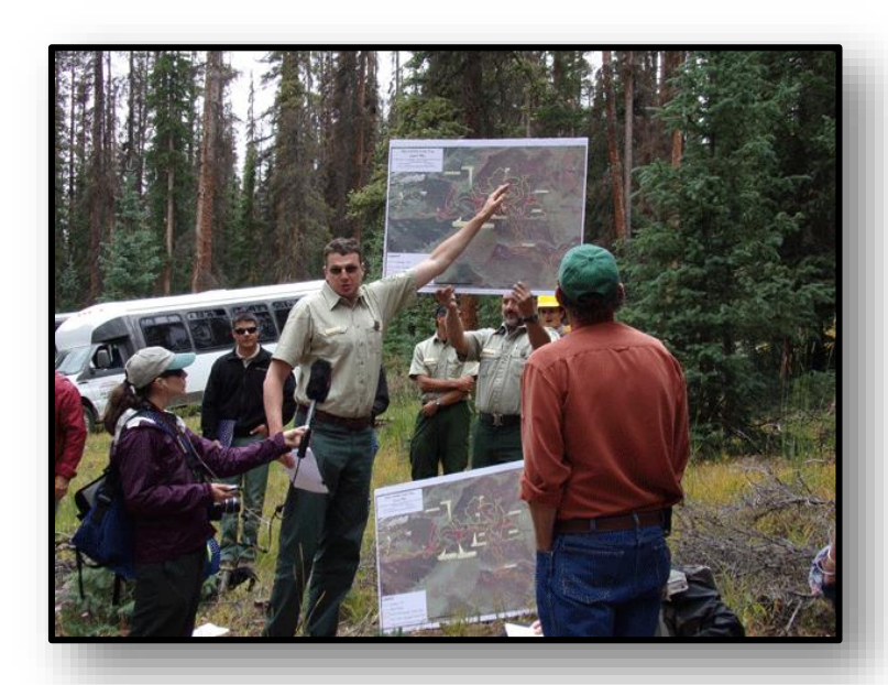
Grand Mesa, Uncompahgre, and Gunnison National Forest USDA Forest Service In cooperation with: Rocky Mountain Research Station, USDA Forest Service Colorado Forest Restoration Institute, Colorado State University